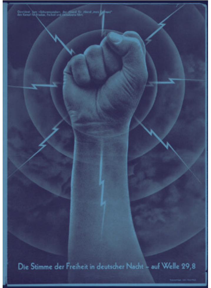
The Voice of Freedom in the German Night. (Die Volksillustrierte)

an-icon@unimi.it https://an-icon.unimi.it